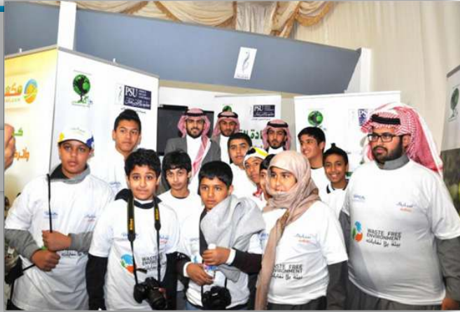
Center for Local Governance Article on Climate Change"